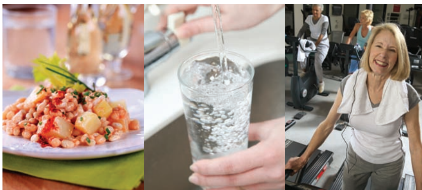
TABLE 2: LIFESTYLE FOR THE PREVENTION AND MANAGEMENT OF DIVERTICULAR DISEASE

Nursing management will vary depending on classification of diverticular disease, presence of complications, and