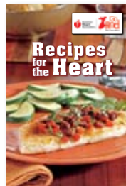
This recipe is reprinted with permission from Recipes for the Heart , Copyright © 2013 by the American Heart Association. Published by Publications International, Ltd. Available on ShopHeart.org, while supplies last.

For a taste change, substitute other fresh herbs for the rosemary and/or oregano. Parsley and sage are just two possibilities. This recipe doubles well.