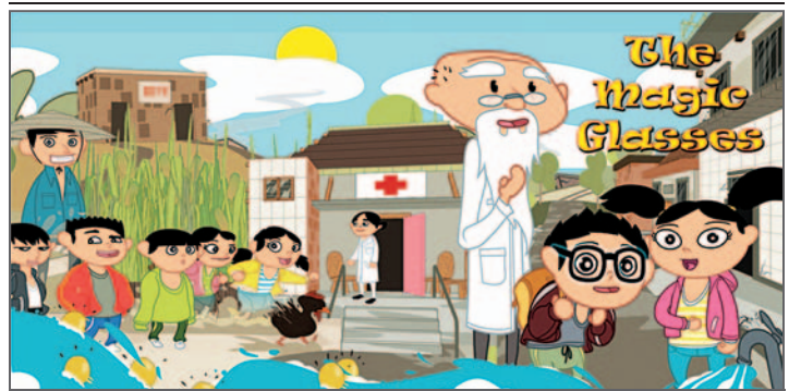
Figure 2. Cover of the Cartoon "The Magic Glasses."

We estimated a design effect of 1.1 on the basis of preliminary survey data from 74 students across 4 schools in the study area. We then estimated the sample size that would be required for an individually randomized trial 9 and multiplied the result by the design effect. Assuming an incidence of infection with soil-transmitted helminths of 6% (which is typical of communities in which the prevalence of such infection is 18%), we esti-