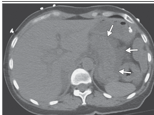
Figure 1. Abdominal Imaging.

The patient had a markedly elevated anion gap of 61 mmol per liter (reference range, 8 to 12), indicating that she had a profound anion-gap meta-