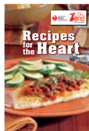
This recipe is reprinted with permission from Recipes for the Heart , Copyright © 2013 by the American Heart Association. Published by Publications International, Ltd. Available on ShopHeart.org, while supplies last.

For a taste change, substitute other fresh herbs for the rosemary and/or oregano. Parsley and sage are just two possibilities. This recipe doubles well.