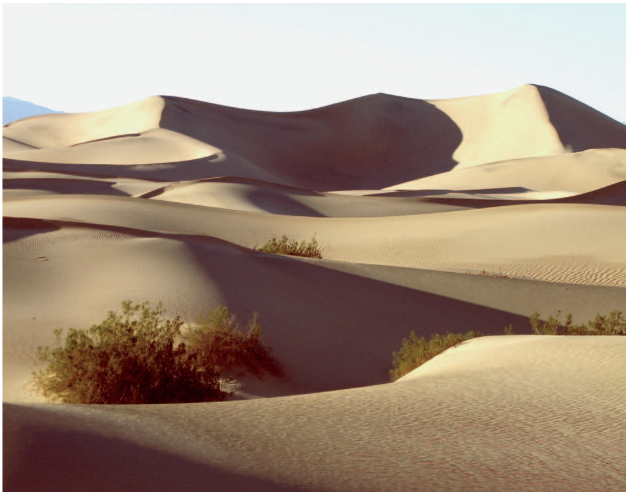
Dunes, Death Valley

Copyright © 2013 Massachusetts Medical Society.